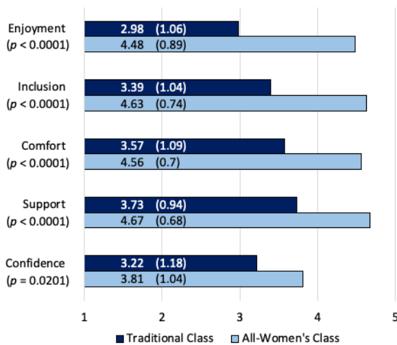
Figure 2: Average responses and standard deviations to Likert scale items by class

discuss these main points and suggest potential reasons for these findings based on previous literature.