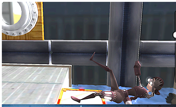
Fig. 2. When an error in a program causes the moving platform to crash, the player’s avatar will fall off (if it is currently riding the platform)

strategy with a 3.54 (SD = 1.450), female students responded with an average 2.21 (SD = 1.251). A one-way ANOVA found this to be statistically significant ( F(1, 26) = 6.482, p < .05 ). Although we can view the Test Platform strategy as an example of computational thinking, it is interesting to note that no significant differences were found between students who reported having had previous programming experience and those students who reported none. 2