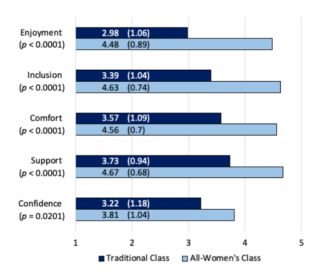
Figure 2: Average responses and standard deviations to Likert scale items by class

discuss these main points and suggest potential reasons for these findings based on previous literature.